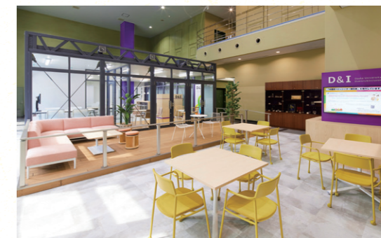
Diversity & Inclusion Space

*If you require exclusive use of the space for an event or the like, please make an inquiry by 17:00, five working days in advance.