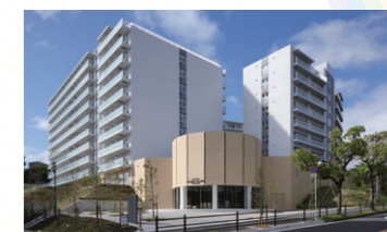
Global Village Tsukumodai Osaka University

We may not always be able to comply with individual requests regarding dormitory residence, but you can consult about them in advance. Please contact the Housing Section, Property Management Division, Department of Finance.