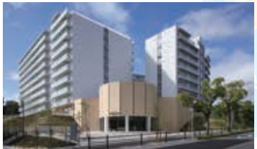
Global Village Tsukumodai