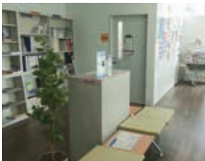
Toyonaka Campus Career Center

The Career Center offers individual consultations of up to 40 minutes per session, which can be reserved through the The University of Osaka Career Support System ( https://sp-uc.career-tasu.jp/login/?id=6cb31723964a2f7b28fba78ea39277d5 ). If you have any concerns or need advice on career matters (whether relating to SOGI or not), please contact the Career Center ( cs-stu@ml.office.osaka-u.ac.jp ). The Center can connect you with a trained and/or experienced advisor. We understand the diversity of sexualities and are committed to helping each and every student realize their potential.